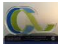
HVAC Accessories Supplier of the Year 2014